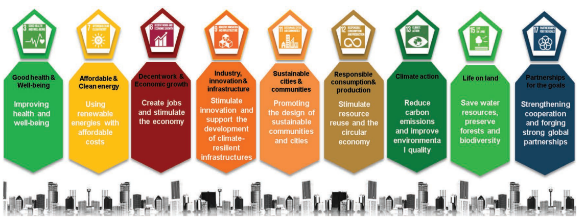
Figure 2: Contribution of buildings decarbonization to the Sustainable Development Goals achievement (Source: Adapted from World Green Building Council).

strengthening energy security, have put the residential sector in many countries around the world in the spotlight due to its substantial energy-saving potential, which could be realized through investments in energy efficiency (Masson et al. 2015; Belaïd et al., 2019; Belaïd et al., 2020). Nevertheless, energy efficiency investments in the building sector appear to be lagging behind the public policy goals set in several countries (Belaid and Rault, 2021; Belaïd et al., 2021; Bakaloglou and Belaïd, 2022).