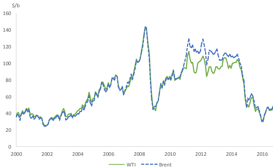
Figure 2 - Global Crude Oil Prices

Adapting the supply-side model proposed by Kaufmann et al. (2004) to assess OPEC's long-term ability to influence real oil prices, we have investigated the effect of the increase in U.S. oil production due to fracking on both global oil prices and OPEC's market power. Drawing on monthly data on the U.S. oil market spanning from January 2000 to December 2016, we employ an Error Correction Model (ECM) to gauge the short-run effects of fracking on global oil prices and on OPEC's ability to steer the market. Among our key