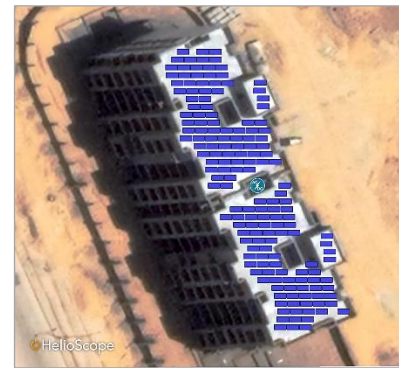
Fig. 2 The designed roof-top PV system