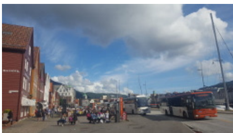
The historic Bryggen Wharf

Traditionally, the IAEE Council meeting is held on a Sunday, preceding the conference, followed by a reception and a Council dinner for the members and invited guests. This tradition was continued in Bergen. The Council meeting was held at NHH, with lunch served in the very special dining and reception room, Stupet, dating back to a Bergen manor from the 1880s. The conference opening reception was at the Radisson Blue Royal Bryggen Hotel, located in the old, picturesque Hanseatic quarter of Bergen. Council dinner members and guests were taken by an electric powered sightseeing train through some of the scenic parts of Bergen and on to the fashionable Bellevue restaurant located high up on one of the Bergen hillsides with a beautiful view of the city. When the party left at 11 p.m. to ride the train back to the city centre and the hotels, the sun was still shining and it was light as day.