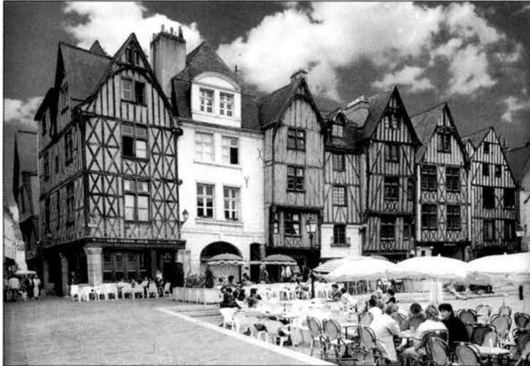
Medieval buildings in old Tours

'Coping with the Energy Future: Markets and Regulation' is the theme of the 15th Annual International Conference of the IAEE. The rapid changes in the energy market offer new challenges and opportunities. New forms of competition, deregulation and privatization are critical issues facing the industry, as are international concerns about how environmental protection will influence energy policies. How will companies react to changing regulations? Will they have an affect on their corporate structure? How will the opening up of Eastern Europe affect the energy market? How will the environmental constraints be managed by the energy sector? These and other questions will be addressed during this major international conference of the IAEE in Tours.