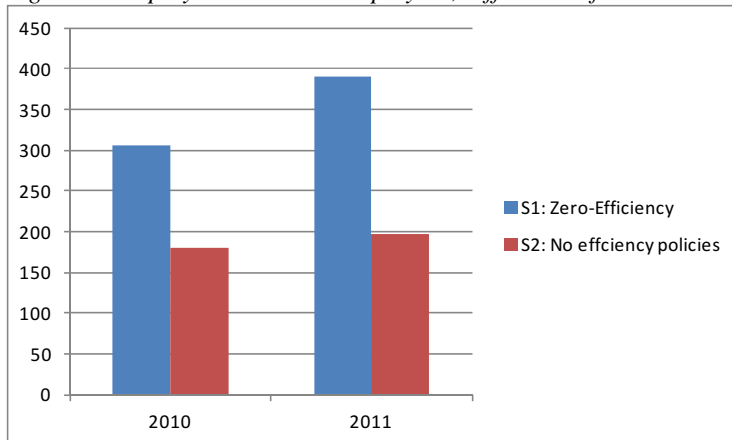
Figure 2: Employment in 1000 employees, difference of "As-is"-scenario to S1 and S2

In terms of employment, approximately 300,000 (400,000 in 2011) people have been additionally employed in the as-is scenario compared to scenario 1. The largest single effect again comes from the eco-tax reform and its labor-cost reduction elements. The construction sector is the second most important pillar of employment from today's efficiency and energy policies (Figure 2).