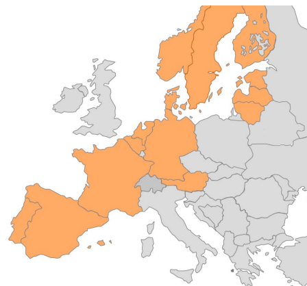
Figure 2: Countries in orange partook in the first go-live of the XBID initiative in June 2018. Snapshot from XBID (2018b).

Despite its existence for several years, the intraday market has been notoriously illiquid. In contrast to the periodic double auction held at day-ahead markets,