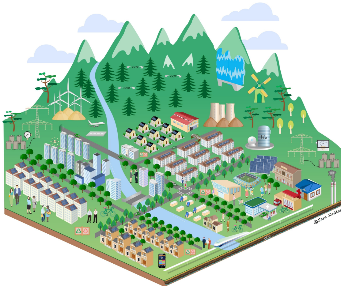
Figure 2: Schematic illustration envisioning the concept of “energy communities” within NZE energy systems.